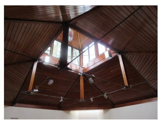
Statement of Significance

A small concrete Brutalist jewel of the early 1970s, sitting happily alongside earlier buildings, within the Blackheath Conservation Area. Although of relatively recent date, the meeting house has overall high significance.